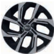
17" GT-Line Alloy wheels