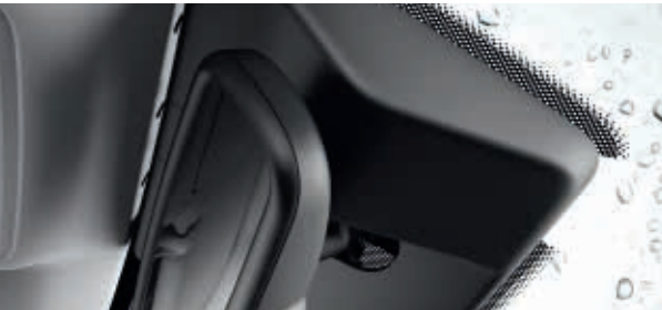
Rain sensor. Your front wipers activate when rain is detected on your windscreen (grade dependent).