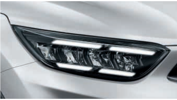
LED projection headlamps. The full LED headlamps produce a more powerful and precise light, allowing you to better detect obstacles at night (grade dependent).