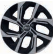
17" GT-Line Alloy wheels