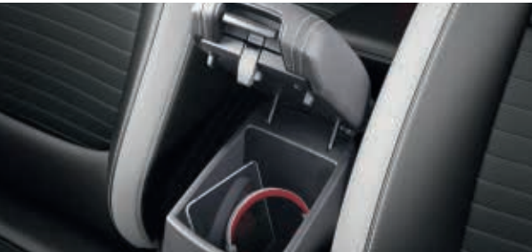
Centre console armrest. The comfortable sliding armrest is integrated with a console that includes two cupholders and a storage compartment.