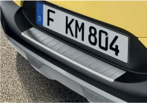
Rear bumper protector, brushed. Whenever you load and unload heavy objects or luggage, this sturdy yet stylish stainless steel protector provides an effective shield to your rear bumper. Also available in chrome optic.