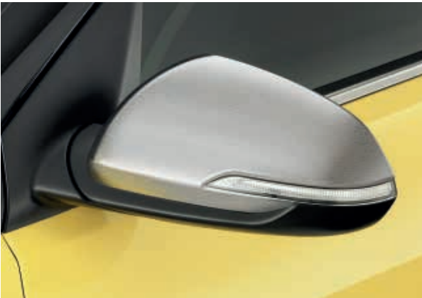
Door mirror caps, brushed. Attention to detail can make all the difference. Raise the overall visual impact of your Stonic by complementing its exterior styling with these brushed stainless steel caps. Also available in chrome optic.

True style is knowing your own mind and expressing your own personality. That's why the Stonic comes with a range of custom-designed accessories from eye-catching side trims to striking entry guards and more. Here's just a small selection of the wide range you can choose from to make your Stonic uniquely yours.