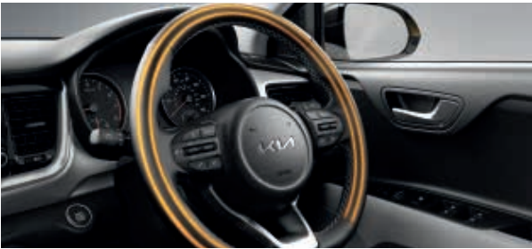
Heated steering wheel. Give your fingers some welcome respite on cold winter days thanks to the Stonic's heated steering wheel (grade dependent).