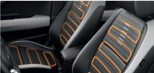
Heated front seats. With three adjustable warmth settings, the heated front seats and seat backs warm up quickly and then level off after the desired temperature is reached (grade dependent).