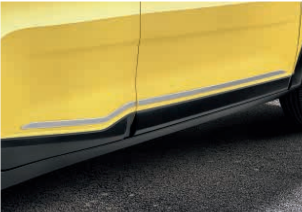
Side trim lines, brushed. Uniquely elegant, these brushed stainless steel mouldings give the side contours of your Stonic a new lease of life with a subtle optical touch. A set of 4, also available in chrome optic.