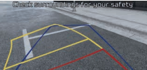
Reversing camera. The 8-inch touchscreen displays the image from the rear-view camera with dynamic guidelines to help you steer your Stonic into place (grade dependent).