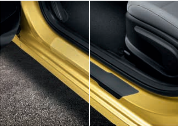
Door sill protection foils. Driver and passenger feet can cause everyday wear and tear to your door sills over time. Protect them with a new surface layer and add these durable foils. Available in black and transparent.