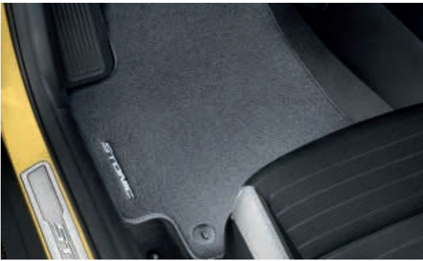
Velour carpet mats. Keep your cabin unblemished for longer. These high-quality velour carpet mats will protect your car's interior from everyday dirt and enhance its look at the same time. Tailor-made to fit the footwells perfectly, they feature the Stonic logo in the front row and are held in place with fixing points and anti-slip backing.