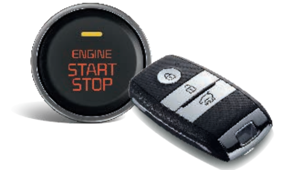
Smart Key & Engine Start/Stop Button. Not need to take your key out of your pocket or handbag. You can access your car and start the ignition with a mere push of a button (grade dependent).

Whatever your needs, the Stonic offers a wealth of equipment to help make it feel like it was custom-made for you from the start.