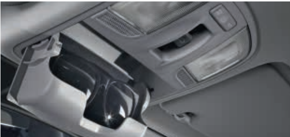
Overhead console lamp with sunglasses case. An overhead console helps you stay organised and keeps your sunglasses just where expect them to be.