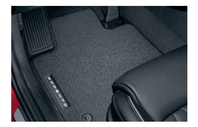
Carpet mats, velour. Keep your cabin unblemished for longer. These high-quality velour carpet mats will protect your Sorento's interior from everyday dirt and enhance its look at the same time. Tailor-made to fit the footwells perfectly, they feature the Sorento logo in the front row and are held in place with fixation points and an anti-slip backing.

When going your own way is seizing new challenges, seeking new adventures or sizing up what the day will bring, then the Sorento is ready with a whole range of Kia Genuine Accessories to match. From time away to time in the city, our selection of high-quality accessories offers clever solutions and special features to personalise your Sorento and make your driving experience a real pleasure.