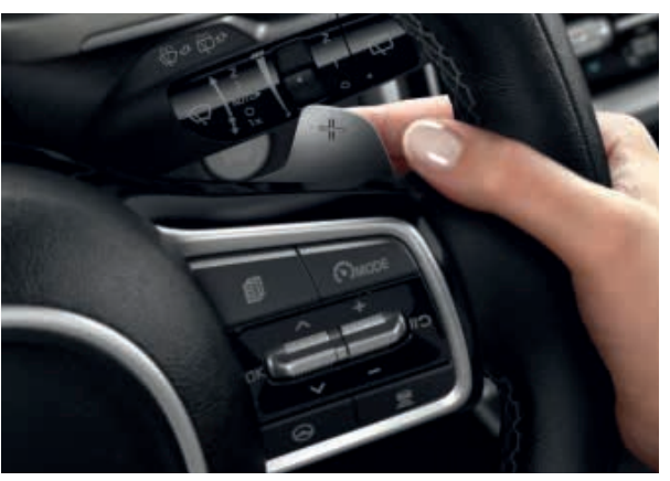
Paddle shifters. Refined paddle shifters coordinate with the rest of the cabin's design and allow you to change gears swiftly without taking your hands off the steering wheel. They also boost driving dynamics, making it effortless to increase torque faster, while staying in control.

Drive Mode Select. The new automatic transmission offers a choice of drive modes that allow you to customise the powertrain's responses to driver inputs, enhancing your fuel economy or acceleration. The Sorento combustion diesel model offers four drive modes, Eco, Comfort, Sport and Smart, while the Sorento Self-charging Hybrid offers Eco, Sport and Smart modes. Drive Mode Select also adapts the weight of the rack-mounted power steering system, for more relaxed or more immediate, engaging steering responses.