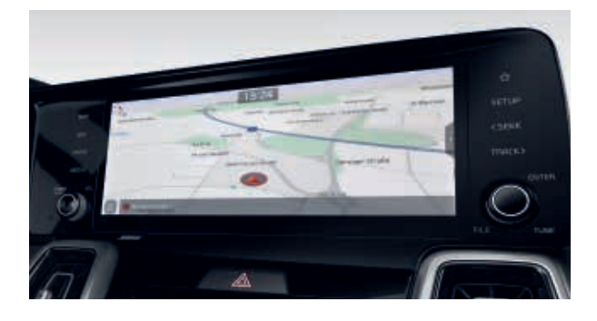
10.25" Navigation System. Select your destination via the high-definition 10.25" touchscreen navigation system, featuring exclusive Kia Connect services. You get precise turn-by-turn guidance, dynamic route planning powered by live traffic data and much more.

From the moment you sit inside the Kia Sorento you'll discover an array of the latest information and entertainment technology, designed to put you in complete control for whatever adventures lie ahead.