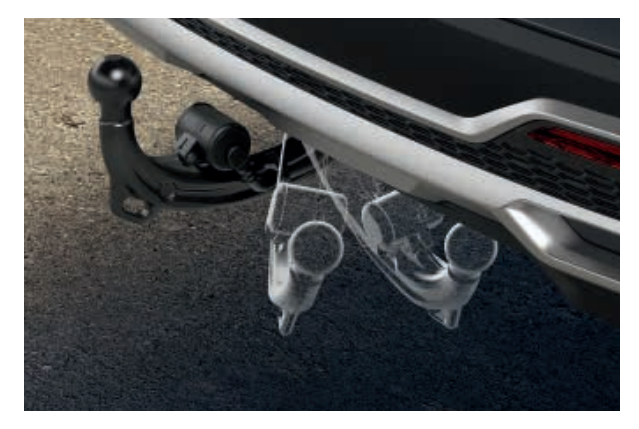
Tow bar, retractable. Would you like to combine even more comfort with efficient transportation? Deployed and retracted via a switch located in the boot, this fully-electric tow bar conveniently folds up and sits invisibly behind the lower bumper when not in use.

Boot liner. Linked to 90% bio-based sources the boot liner supports responsible production of bio-based plastics according to ISCC (International Sustainability and Carbon Certification) requirements. The bio-based content is sourced from renewable feedstock in the form of wood and agricultural waste not suited for food production. Durable, anti-slip and waterproof with raised edges this custom-made liner protects your trunk from wet, muddy or grimy things and is easy to clean.