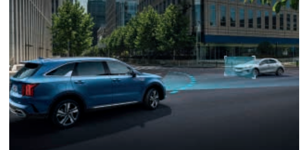
Forward Collision-Avoidance Assist. Evaluating both camera and radar data, the system monitors other cars, pedestrians or cyclists ahead to avoid a potential collision. It also functions to prevent collisions with oncoming vehicles when making a right turn at an intersection. If it detects a potential collision, a warning signal appears on your instrument cluster and maximum braking power is applied.