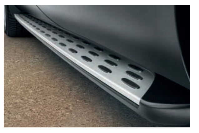
Side steps, sporty. Take your Sorento's styling up a notch with these robust side steps underlining the unique character of your car. Aluminium inlays and anti-slip rubber elements ensure easier access to the cabin & to roof-mounted accessories. Can be combined with mudguards.