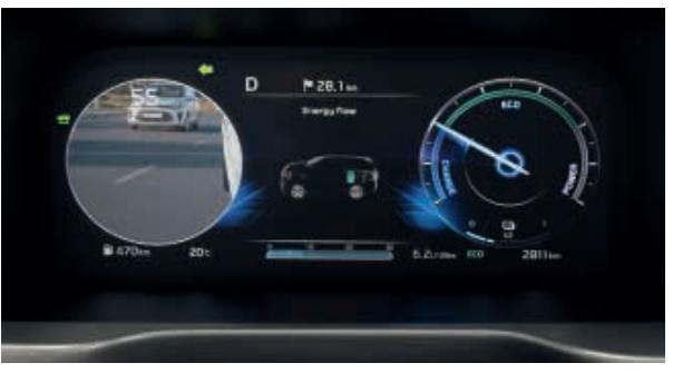
Blind-Spot View Monitor. Designed to improve visibility for blind spots, it displays images from the relevant rear-view side camera in the instrument cluster when you indicate.

Blind-Spot Collision-Avoidance Assist. When you want to change lane, Blind-Spot Collision-Avoidance Assist detects any vehicle(s) in your blind spot and alerts you with a warning symbol in your door mirror and on the head-up display inside the car. Should you start to change lane while a car is in your blind spot, the Sorento will automatically apply the brakes to avoid a collision, the side mirror and head-up warning symbols will flash and an audible alert will sound.