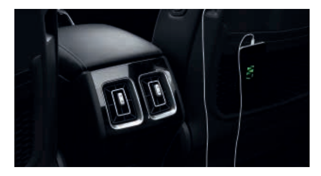
USB ports and power for all. Both the first-row seatbacks have integrated USB charging ports for the use of first and second-row passengers. Additionally, the cargo area features USB charging ports on each side for the third-row passengers. What's more, the rear centre console has a USB charge port and 12 V socket as well - perfect for playing games and charging.