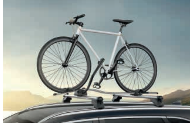
Roof bars, aluminium. Light and easy to install, these strong and perfectly fitting aluminium cross bars will help you transport all you could possibly need on your next adventure. Bike carrier Pro sold separately.