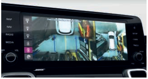
360° Surround View Monitor. Assurance all round: this intuitive system combines four wide-angle images from cameras on the front, rear and sides of the vehicle to give you a comprehensive bird's-eye view of the space around the Sorento while parking or moving at speeds below 12 miles/h.