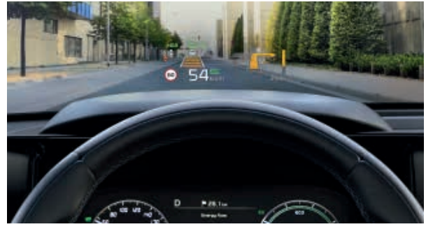
Head-up display. To ensure you keep your eyes on the road, the head-up display projects graphics and other driving-related information onto the windscreen, directly in your line of sight.