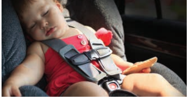
Rear Occupant Alert. Uses ultrasonic sensors that are designed to detect children or pets in the second or third row, and gives visual and audible alerts if it detects movement inside - before and after the vehicle has been locked.

Safe Exit Assist. This feature helps prevent passengers from exiting the vehicle when a potential hazard is approaching from the rear. When it detects danger, the system engages the power locks and gives an audible and visual alert.