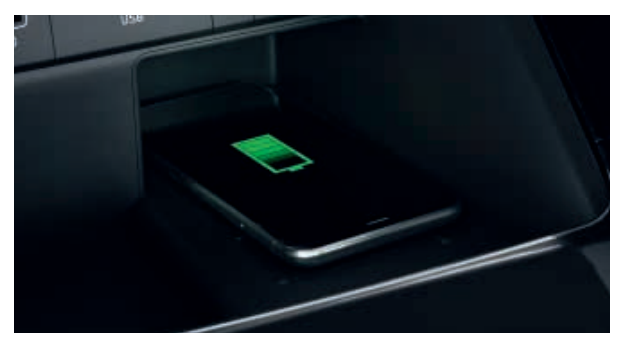
Wireless smartphone charger. Forget cables, you can charge your mobile phone wirelessly and effortlessly by placing it on the charging pad at the front of the centre console.